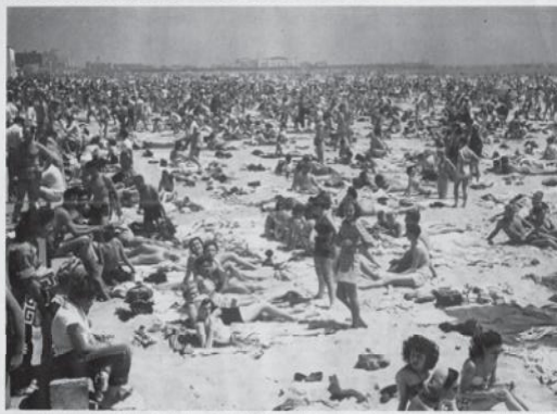
This section of Santa Monica beach is known as "Rendezvous Point" and is especially popular with teenagers. All the facilities that should be present to care for a crowd of the size—swims rack, parking area, machine facilities, bathhouses, sport and playhouse structures—were sadly deficient. Better than all the work in Webster, the photograph proves that beach development in Los Angeles County, at this time, is an immediate, pressing problem.