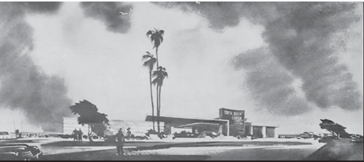
California Coast 2:4 (May 1950): 2.