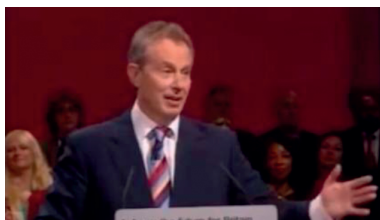
Figure 5. Vertical left palm facing the audience on “take the flak”