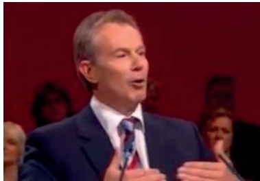
Figure 2. Both palms with extended fingers facing the torso move forward and down on “push it”

In (14), the three words Wilson , push and divisive receive extra prosodic salience, with vocal stresses synchronized with three gestural beats. The shape of the hand indicates a link with the metaphor push it , which is also at the centre of the prosodic salience. Both palms are flat, facing Blair's body and form an imaginary vertical plane (see Figure 2). On each prosodic beat, the hands move forward and down, as though marking steps in a progression.