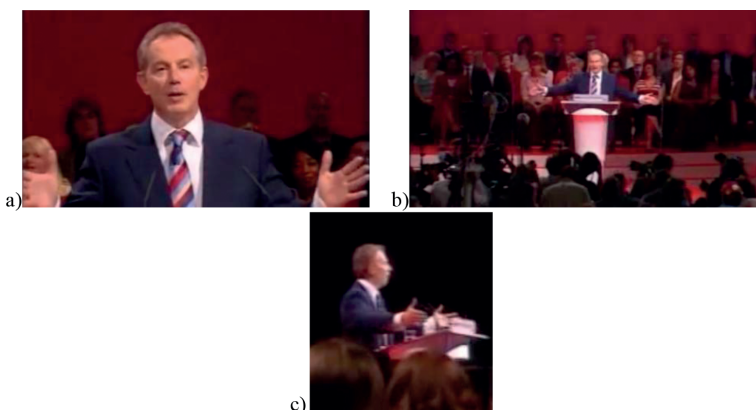
Figure 4. Extended arms with open palms facing away: Blair’s gesture of inclusion

at the same time presenting new ideas and including his audience in his speech. In variations of the gesture performed with one arm, Blair appears to simply reinforce the interpersonal dimension of his speech when highlighting a new idea. In other more emphatic versions of the gesture, particularly those performed with both arms, the effect is much more theatrical: Blair visually includes his audience, by embracing his party members with his whole body, as shown in Figure 4.