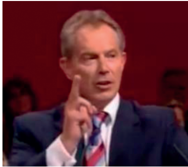
Figure 6. Marking prosodic stresses visually on “our core vote is the country”