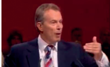
Figure 3. Extended fingers facing the torso move forward and down on “on the way up”

Gesture space and orientation are organized in a highly consistent way in this speech, since another version of this gesture, performed only with one hand this time, occurs a minute before (at 11'41), as illustrated in Figure 3.