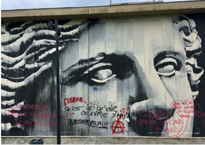
Figure 2. Louvre/Nanterre street art project fresco opposite Humanities building, with critical graffiti.

no less political than slogans in large letters: by indexing the larger context, this written piece of discourse leaves, at least temporarily, a lasting trace of the time and place of the occupation.