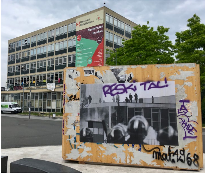
Figure 1. Re-staging the riot police intervention.

les toits' ('Nanterre on the roofs'), visible in one of the pictures, was actually still hanging from the roof on 4 June 2018 (see Figure 1), as a sign of the on-going occupation of the premises.