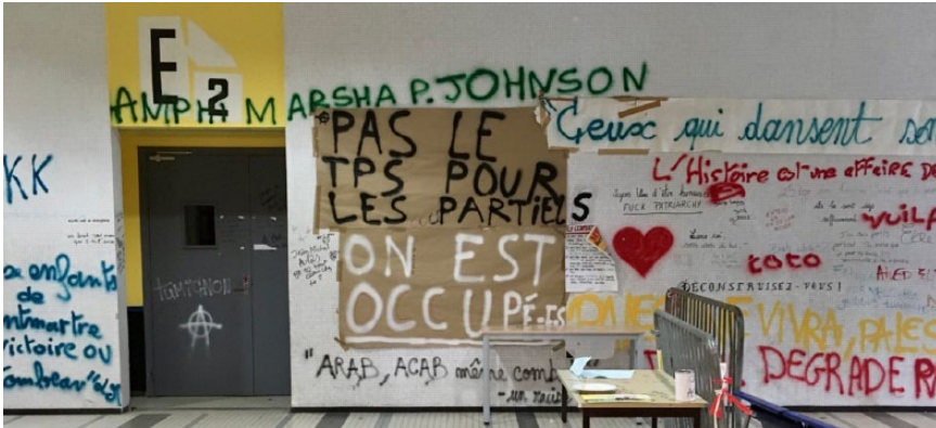
Figure 6. Graffiti and posters, main hall, ground floor, building E.

revisited and modified based on the paronomasis (sound similarity) between ‘classer’ (‘classify’) and ‘casser’ (‘break’). This slogan can be understood as programmatic: once you start thinking about the situation, the only conclusion you can come to is to destroy sites of institutionalized political oppression. It can also be read as a legitimization of the degradations imposed on the university’s facilities during the mobilization, framed as the result of political reflection.