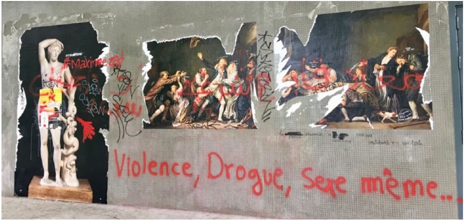
Figure 3. Torn Louvre/Nanterre street art project posters on an outside wall with graffiti.

exasperation, after a declaration perceived as fairly confused by some. The University President's name was used in a number of puns like 'balaudégradation' or 'balaudémision' (portemanteau words including the French words for 'degradation' and 'resignation') which, beyond their humorous function, constituted a form of address to, or request from, the presidential team.