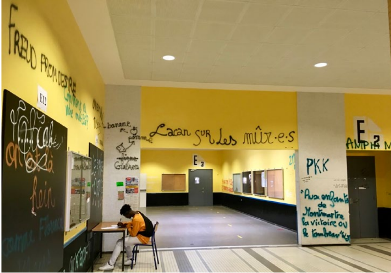
Figure 5. Graffiti, main hall, ground floor, building E.

Michel (referred to as LM in the graffiti), who was an anarchist, a feminist and one of the most famous figures of the Paris Commune, a radical socialist and revolutionary government that ruled Paris from March to May 1871. This reference presented the student protest as a revolutionary movement and a direct offspring of the Paris Commune, also suggesting that women play decisive roles in political revolutions.