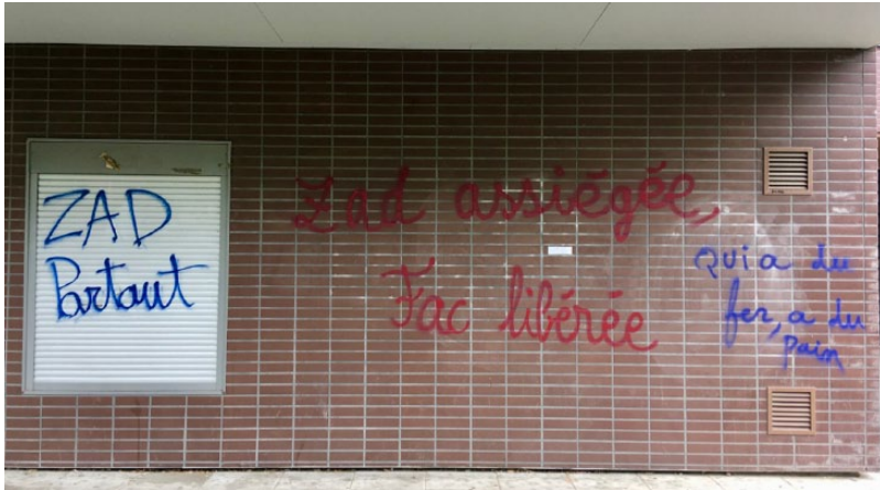
Figure 8. Graffiti, outside wall, Maison de l'Étudiant.

raison' ('Arkana was right', probably referring to female rap singer Keny Arkana) written on the main wall of Humanities building L and to their song lyrics, found mostly inside occupied building E. 'J' VOIS LA VIE EN ROUGE CAR LES FLAQUES DE SANG SONT RAREMENT ROSES' ('I see life in red because pools of blood are rarely pink') at the bottom of a staircase in building E. This quote by Parisian rap singer Jazzy Bazz alluded to the song line 'je vois la vie en rose' ('I see life in pink') from Edith Piaf's famous 1945 song 'La vie en rose', but in a much darker, more violent reinterpretation, mirrored by the dark locus of the graffiti on a wall below a flight of stairs. 'On sauvera pas toute la terre j'prends la couronne la pose sur la tête du petit frère' ('we won't manage to save the whole planet I take the crown and put it on the little brother's head') is a quote from a song by PNL ('Peace N'Lovés'), a famous rap music band from the northern suburbs of Paris.