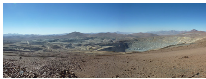
Figure 3 View from the modern Rosario mine at Collahuasi, Chile.

offer new avenues of research at Saint-Véran where the working organisation underlying the Early Bronze Age copper massive production is not yet fully understood. Regarding technology, the exact role of the efficiency of the smelting process in the change of production scale has to be examined as well. In Northern Chile, the apparent absence of any clear technological improvement needs further investigation. At Saint-Véran a "Bronze-Age" technological revolution has clearly occurred, although the two types of metallurgies recognized so far, namely the non-slagging and the very efficient slagging process have still to be phased chronologically in relation to each other. Finally, the very question of the copper ore destination needs to be addressed. For example, in Prehispanic Northern Chile copper seems to have been traded more as an ore than as a metal. The huge disequilibrium between the mining production at the Tranchée des Anciens and the smelting activity obliges to reconsider this aspect at Saint-Véran as well.