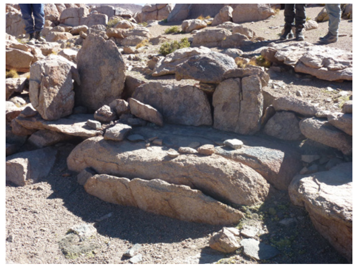
Figure 4a Large stone wind-powered furnace at Ujina 8 (benchshape type).

offer new avenues of research at Saint-Véran where the working organisation underlying the Early Bronze Age copper massive production is not yet fully understood. Regarding technology, the exact role of the efficiency of the smelting process in the change of production scale has to be examined as well. In Northern Chile, the apparent absence of any clear technological improvement needs further investigation. At Saint-Véran a "Bronze-Age" technological revolution has clearly occurred, although the two types of metallurgies recognized so far, namely the non-slagging and the very efficient slagging process have still to be phased chronologically in relation to each other. Finally, the very question of the copper ore destination needs to be addressed. For example, in Prehispanic Northern Chile copper seems to have been traded more as an ore than as a metal. The huge disequilibrium between the mining production at the Tranchée des Anciens and the smelting activity obliges to reconsider this aspect at Saint-Véran as well.