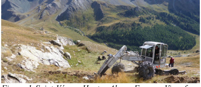
Figure 1 Saint-Véran, Hautes-Alpes, France. View from the copper mine 'La Tranchée des Anciens'.

Whereas a single model of copper extractive metallurgy has long been assigned to the Early Bronze Age Saint-Véran district, namely large-scale reduction of bornite thanks to very efficient smelting processes (Bourgarit et al, 2010), current fieldwork and slag investigation are putting into light a much less mature metallurgy (Figures 1 and 2). This alternative technology has yet to be phased in order to determine its place in the metallurgical activity of the district.