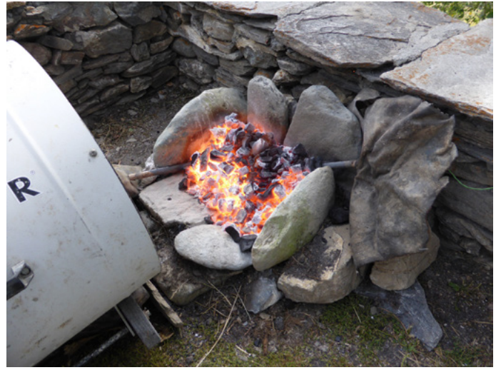
Figure 4b Reconstruction of an Ujina-Collahuasi benchshape furnace for a smelting experiment; a 40 km/ h^{-1} wind was produced with an industrial fan.

Despite the fact that considerably more fieldwork has been done in Europe, our understanding of ancient metallurgy in the Prehispanic Andes is more advanced than for the European Alpine Bronze Age. This is obviously related to both a better conservation of the Chilean sites and to the availability of ethnohistorical sources. Moreover social, political and economical contexts so far have been much more taken into consideration in South-America than in Europe in order to study the historical development of metal production. These may also be future prospects of research.