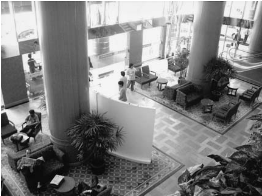
Figure 7.1 The main entrance of Bumrungrad Hospital is similar to any five-star hotel

When you enter the BIH, a hostess greets you and guides you to the reception or the concierge. In the same building, the ground floor consists of a central lobby containing plants, bamboo and fountains which create a pleasant ambience. All the furniture – chairs, desks, sofas – are made from good-quality wood and the natural light coming through the windows creates a comfortable place. It is now common for the patient to have his/her own private room where he/she may accommodate some guests for the night.