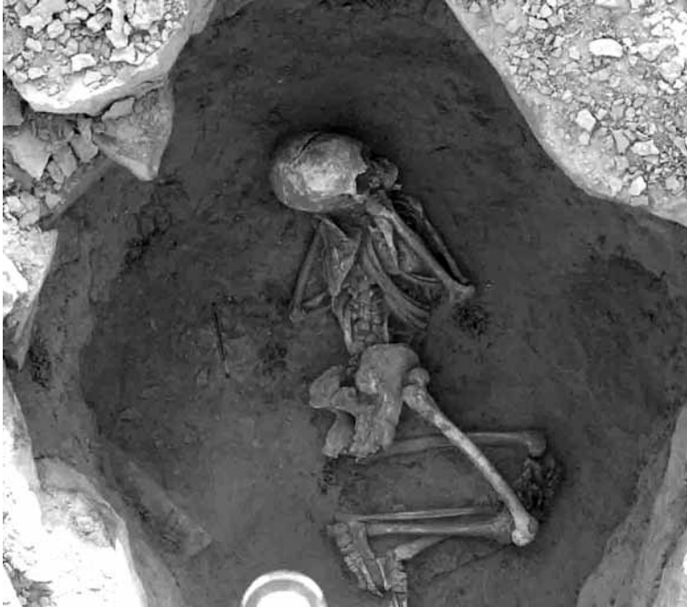
Fig. 2a: The upper 1st millennium BC (Nabatean) adult female burial