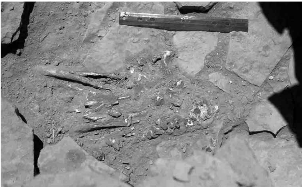
Fig. 2b: The lower Late Neolithic unsexed adult burial. Note marked difference in preservation between the two burials