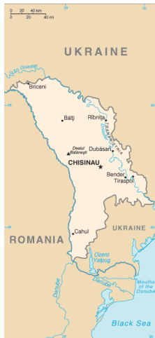
(CIA World Factbook 2003)