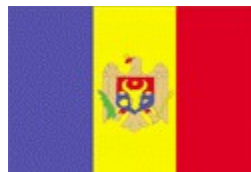
Rep. of Moldova