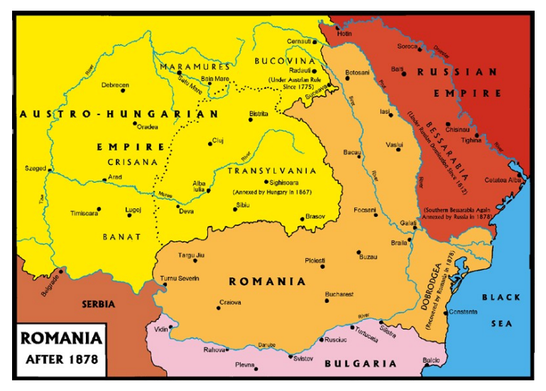
(from Treptow, 1996)

century). In the 19<sup>th</sup> century two of the kingdoms, Moldova, without Bessarabia, and Walachia benefited from favourable geopolitical circumstances to unite under the name of Romania.