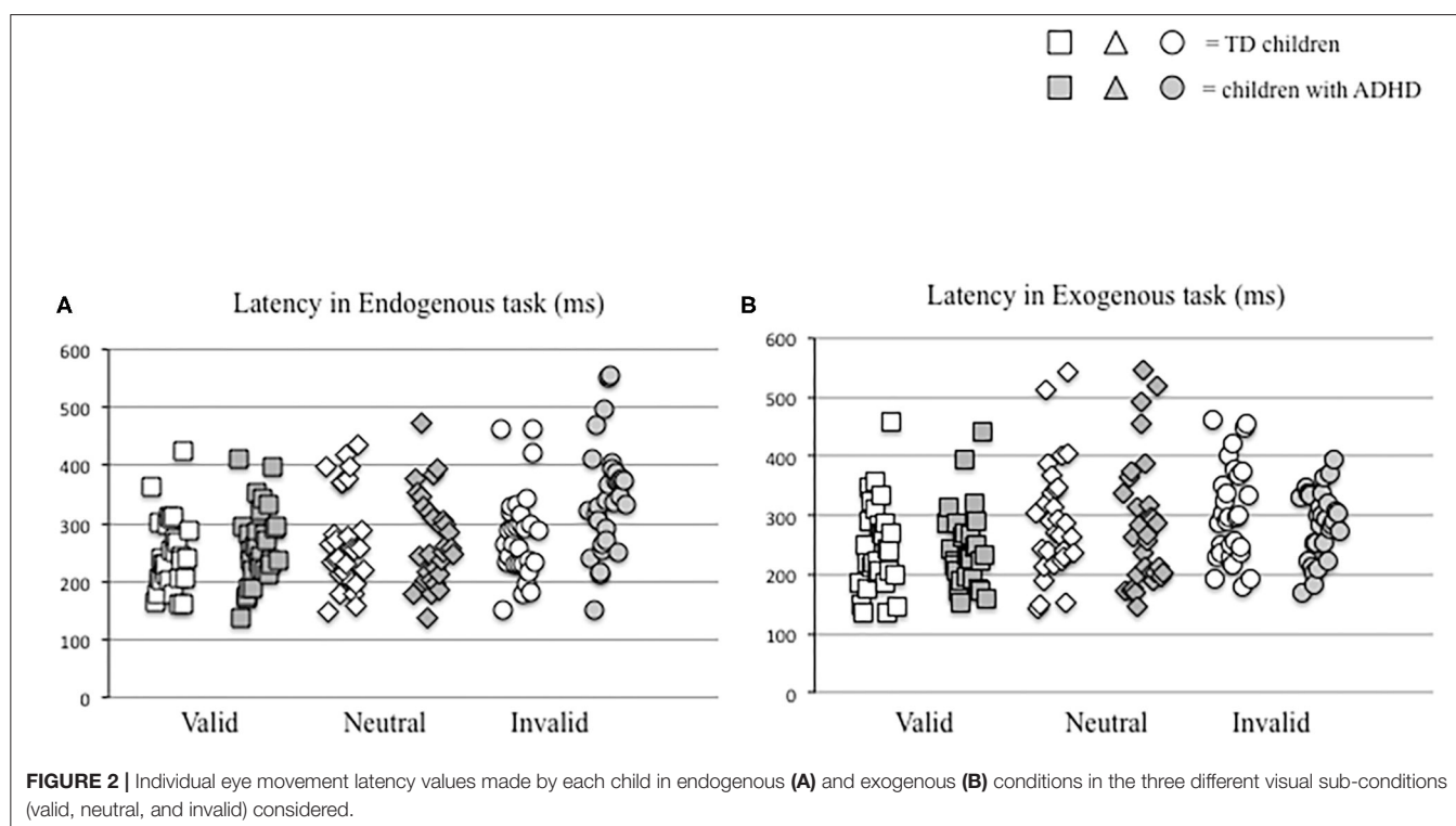
FIGURE 2 | Individual eye movement latency values made by each child in endogenous (A) and exogenous (B) conditions in the three different visual sub-conditions (valid, neutral, and invalid) considered.

(see Table 2B ) showed a significant difference of the number of errors in the endogenous condition for the neutral sub-condition ( p < 0.03 ), and in the exogenous condition for the neutral and invalid sub-condition ( p < 0.004 and p < 0.01 , respectively); children with ADHD showed a higher number of errors in the endogenous condition for the neutral sub-condition and in the exogenous condition for the neutral and invalid sub-condition when compared to TD children.