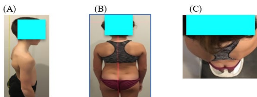
Figure 2. Measure of the spinal instability in the sagittal, frontal and horizontal plane. (A) Example of anterior scapular deviation in the sagittal plane. (B) Example of deviation in the frontal plane. (C) Example of right scapular torsion in the horizontal plane.

Finally, a protractor is used to measure the angle formed by the axis of the shoulders and the projection of the straight line formed by the edges of the heels in order to assess the postural deficit in the horizontal plane. The child presents a postural disorder in the horizontal plane if the projection of these two lines is not parallel (Figure 2C).