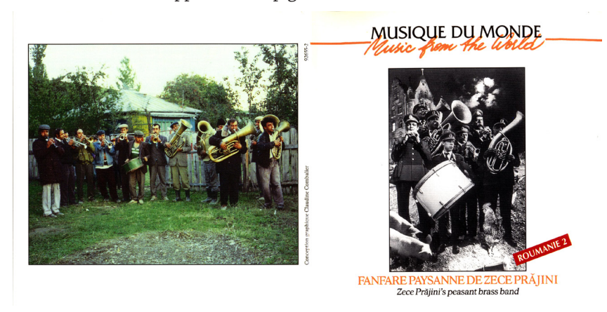
Fig. 2. Front and back covers of the CD Fanfare paysanne de Zece Prăjini, Buda Records, 1996.

signaled high class and prestige. At the other end, right in the foreground at the musicians' feet, appeared two pigs and a rooster.