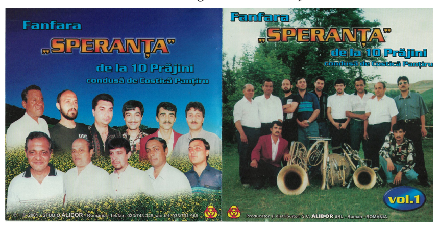
Fig. 3. Front and back covers of the CD Fanfara "Speranța" de la 10 Prăjini: Vol. 1, S. C. Alidor S. R. L., 2001.

The leaflets of the Alidor CDs consisted of one sheet of paper, printed in color and folded in two. Each of its two halves was fully covered by one picture of the band (printed in color on the outside, and repeated in black and white on the inside). One of these pictures invariably showed the whole band posing with their instruments (but not playing them). They were surrounded by nature, standing on grass, with trees and sometimes hills in the background. They had shaved, their hair was combed and they wore their best clothes for the occasion. (On one of the CDs they also wore a set of folkloric costumes which Doru lent to them.) The other picture was invariably a photomontage. The band's members were photographed individually, and their portraits were assembled over a vividly colored background. For Fanfara Speranta: Vol. 1, this consisted of blue skies, some hills and fluorescent yellow flowers (Fig. 3). On other disks, there was simply a non-figurative gradient of colors. What mattered in this photomontage was the individual portraits. There was no text on the cover, except for the title, the credits, the track listing, and the leader's phone number.