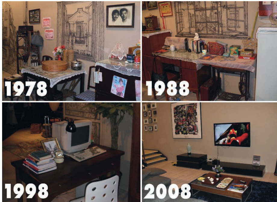
FIG. 2 – Three decades of Chinese living rooms. The China pavilion’s “Reminiscence” exhibition area

a “modernist pact” situating the centre of the world in Shanghai, and more broadly in China. 19 With this “mega-event”, the state pursued two aims: to give the world a demonstration of China’s place on the international stage, one capable of conveying an international theme (that of the ecological city), and to firmly establish the political strategy implemented by Hu Jintao, creating “homo harmonicus”, the result of a utopian ideal, that of the “civilised” and “patriotic” Chinese citizen (Boutonnet, 2009). Judging by the reaction of the Chinese audience in the film theatre, this approach seems to have been particularly effective. In any case, it was reinforced again upon exiting the screening, by the room that the audience was forced to pass through in order to continue their visit of the China pavilion. This space was dedicated to the theme of “reminiscence” ( suiyue huimou 岁月回眸). It presented a succession of four life-sized reconstructions of houses from different eras: 1978, 1988, 1998 and 2008, like film sets ( changjing 场景). 20 Closely contemplating true-to-life dwellings with objects and family photos typical of each era caused everyone to recall periods of their own life, or those that their parents or grandparent had experienced, just as Proust’s madeleines did. The contrasting of eras added to the dizzying effect of the film, in the hindsight that was possible with regard to the “path travelled”.