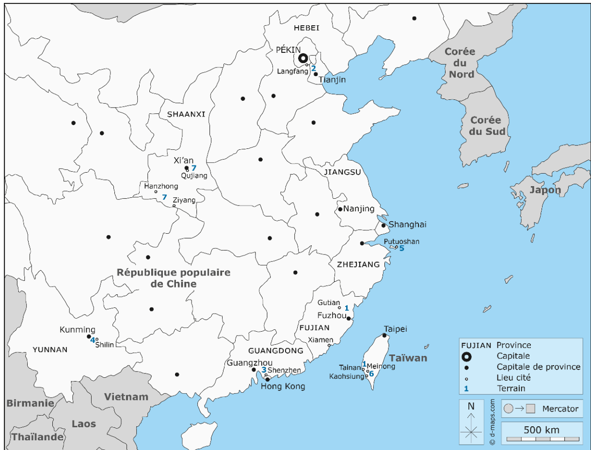
FIG. 3 – Map of field sites mentioned in the contributions in this issue