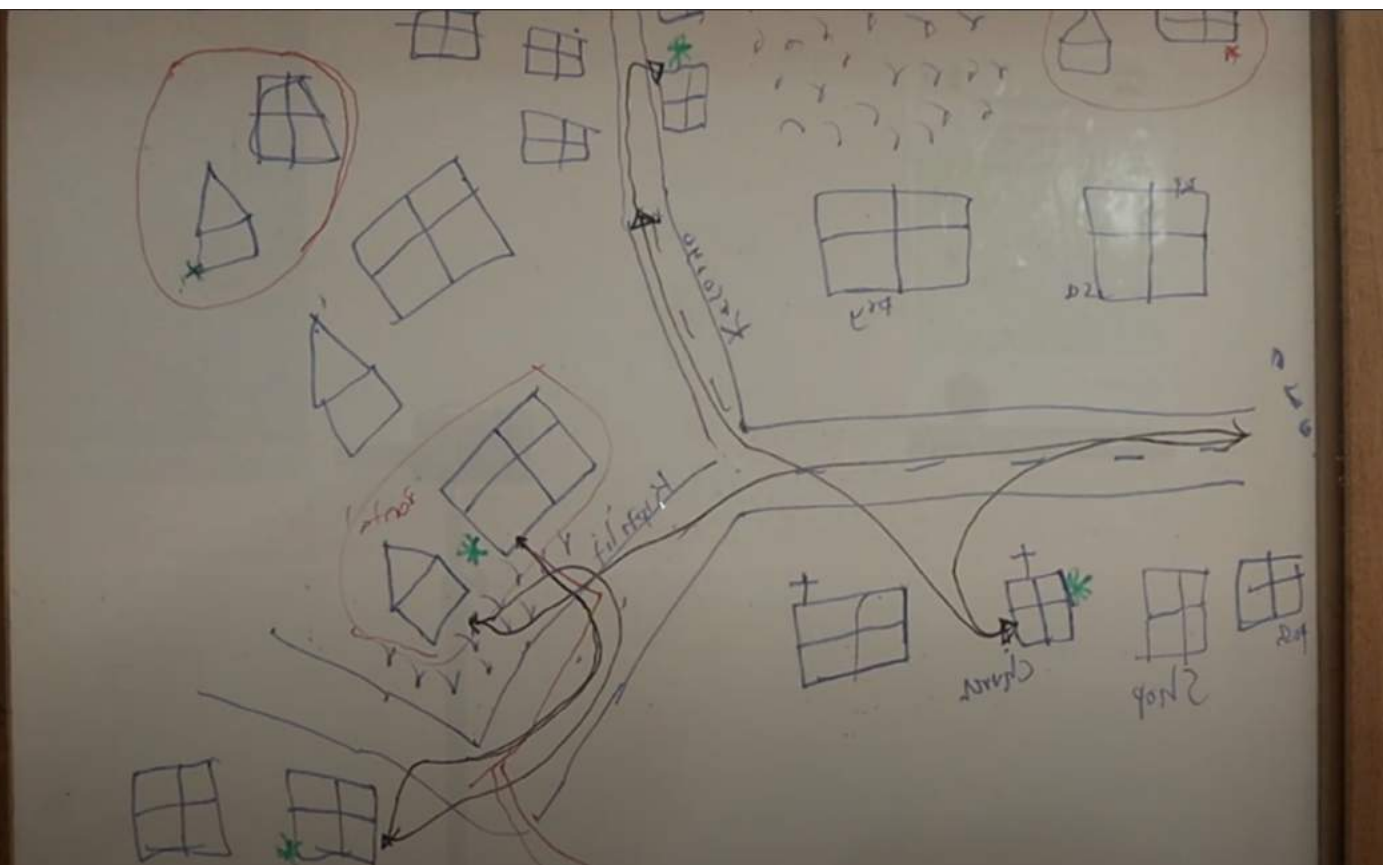
Baringo, Kenya, movie from 2023